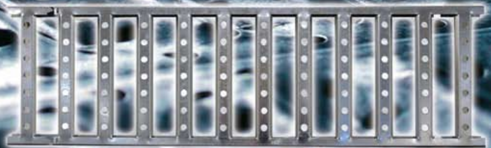
PARTHENON® Support Profile