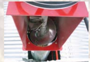
Power Head Discharge