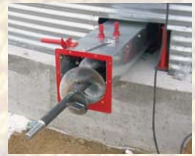
1/4-Inch (6-mm) Thick Auger Flight Is Easily Removed And Reinstalled From Outside The Bin

Available For 36-Through 60-Foot (11 to 18.3 m) Diameter Bins