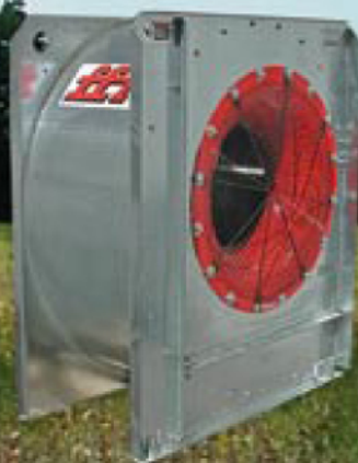
Deluxe Downstream Heaters