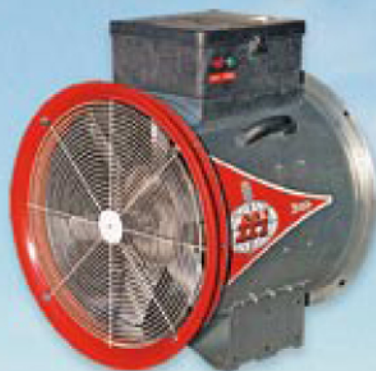
Deluxe Quad Vane Axial Heaters