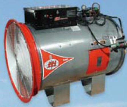
Silver King Series Vane Axial Fans