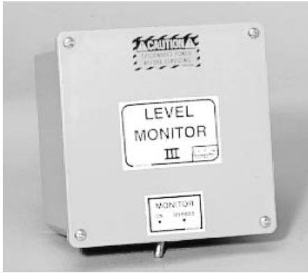
Level Monitor III

Designed for on-farm and/or commercial environments, the level Monitor III, comes with a one year limited warranty.